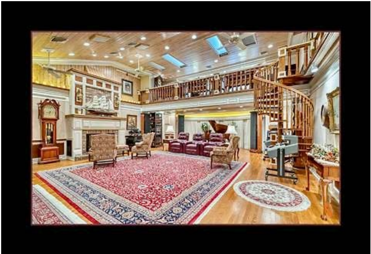
Floor to ceiling, designed for optimized sound reproduction.