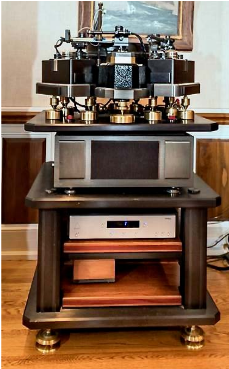
750 lb. turntable with Sota 80 lb. lead vacuum platter, atop a Minus K vibration isolator.

composed of three separate banks of drivers, each covering a different area. Each of those banks is, in turn, driven by its own amplifier. Additional amplifiers are used to drive the subwoofers, and side and rear surround loudspeakers. A dozen amplifiers with a combined output of 70,000 watts drive the entire system. With an LP playing classical music, standing back 30 feet from my array, I can feel the music pounding on my chest. It was critical to further isolate the turntable from these intense vibrations emanating from my speakers."